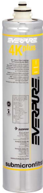
4K-Plus Replacement Cartridge: EV9612-71

Delivers premium quality water for foodservice, vending and OCS applications